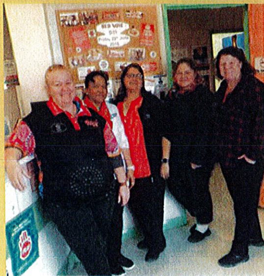
Wearing red to work to promote RED NOSE DAY