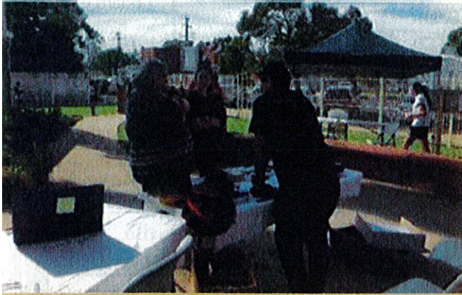
Community members learning about Hepatitis B at the Awareness Day

WITH BREWARRINA ABORIGINAL HEALTH SERVICE (BAHSL)